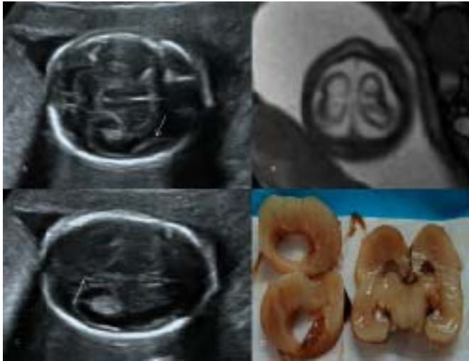
Figure 1A: Transverse ultrasonographic view of the fetal brain at 26 weeks showing smooth Sylvian fossa (arrow). B: Transverse ultrasonographic view of the fetal brain at 26 weeks showing absent parieto-occipital sulcus (arrow) development. C: Axial T2-weighted b-TFE image through the level of lateral ventricles. The gyri and sulci of the cerebrum are highly premature with respect to the age of the fetus. D: Postmortem examination of fetal brain showing complete absence of cortical sulci, and gyria at coronal sections.